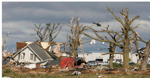
The aftermath of a devastating tornado that struck the Toledo area on June 5, 2010.